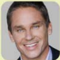
MARCUS BUCKINGHAM New York Times Best-Selling Author and Visionary